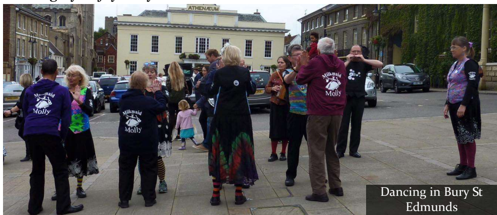
Dancing in Bury St Edmunds

Our public performances always end with encouraging the audience to join us in dancing Circassian Circle. Our practice sessions are always joyous, if somewhat noisy, and chaotic affairs but always thoroughly enjoyed by all.