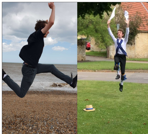
A Year of (Not) Dancing