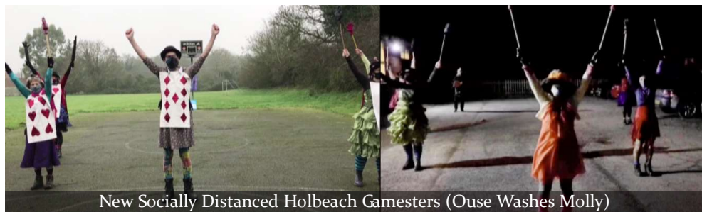
New Socially Distanced Holbeach Gamesters (Ouse Washes Molly)