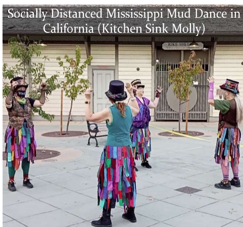
Socially Distanced Mississippi Mud Dance in California (Kitchen Sink Molly)

“The final programme brought together over 250 videos, audio tracks and photos. Splitting the work into smaller pieces that could then be combined was essential to make the project manageable. Using a limited version of PowerDirector and a PC just powerful enough for the more complex tasks required a bit of ingenuity to make it work, but ultimately it did!”