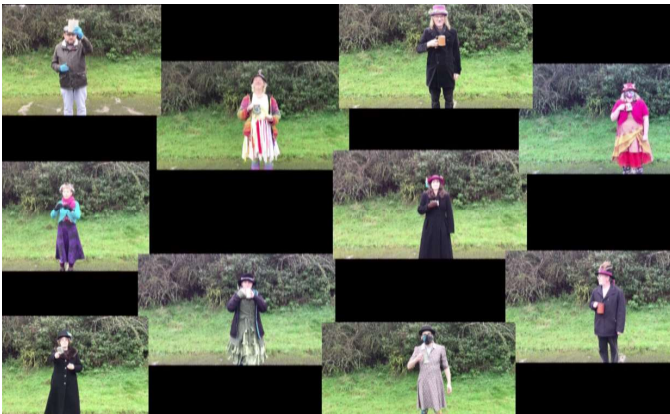
Celebration Drinks with Ouse Washes Molly