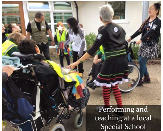
Performing and teaching at a local Special School

Buddies themselves learn more complex dances, some self-choreographed and some taught by members of local Molly sides. When these are performed, the Mollies provide percussive (and a guitar) instrumental accompaniment with the musicians. Some of the Mollies take great delight in spotting when we make a mistake and even score us out of 10 (Strictly style!)