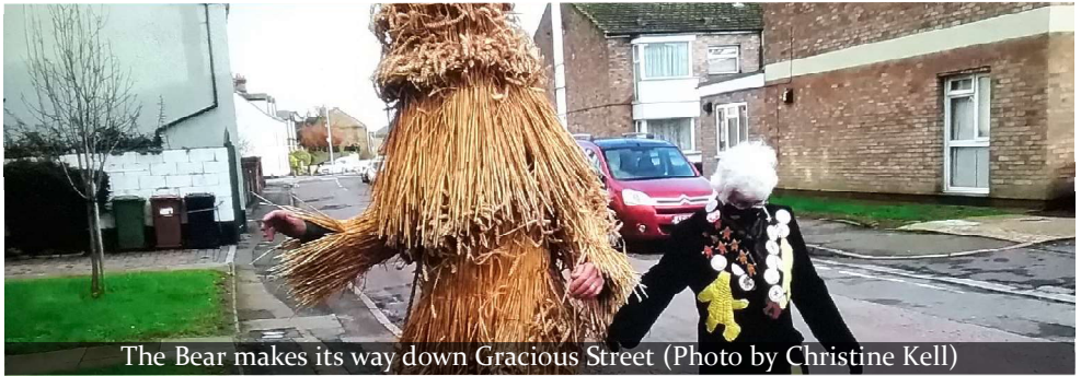
The Bear makes its way down Gracious Street