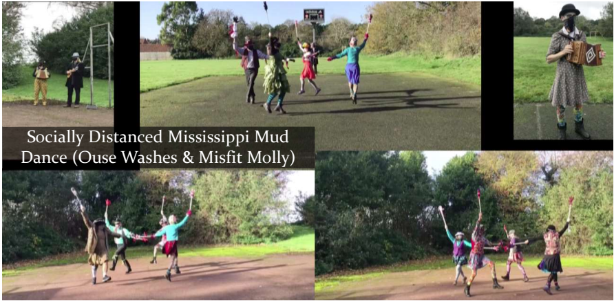
Socially Distanced Mississippi Mud Dance (Ouse Washes & Misfit Molly)

“A couple of the dance videos received had background wind noise so severe that the soundtrack was unusable. To remedy this, the instrument parts were re-recorded in the studio and blended with the originals to minimise the effect of the wind noise. Finally, adding a few deliberate background noises (such as the crunch of boots) to some of the recordings completed the process, resulting in the music as heard during the event.”