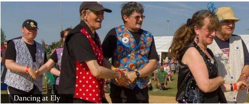
Dancing at Ely

In addition here are some thoughts from a few of our Buddies: