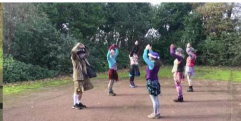
Birds a Building Chorus Line (Ouse Washes & Misfit Molly)