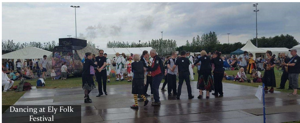
Dancing at Ely Folk Festival

Most of our Mollies live in the community in sheltered or supported living accommodation, some travel independently to practice sessions, and some bring carers if they need additional support. When travelling to dance outs we have to hire a minibus and we have been very fortunate in receiving some very generous donations to help fund this, and also to help with the purchase of our team T-shirts and hoodies.